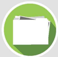
File Folders, Office Paper, Envelopes