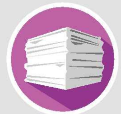
Newspapers, Catalogs, Phone Books, Paper Bags