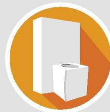
Paperboard Boxes - Cereal, Tissue & Frozen Food Boxes