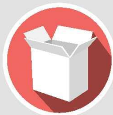
Flattened Cardboard Boxes