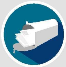
Junk Mail, Glossy Paper, Magazines